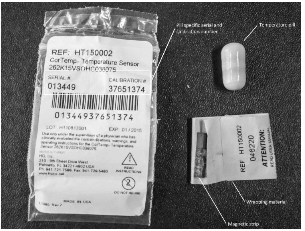
Figure 2. Ingestible telemetric temperature pill . Ingestible telemetric temperature pill and packing material. On the left the wrapping material is visible, which contains the temperature pill individual serial and calibration number. On the right, the temperature pill and the magnetic stripe are shown. In this case the temperature pill is not in contact with the magnetic stripe, which means that the battery is activated. Please click here to view a larger version of this figure.